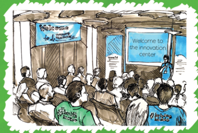
Challenge owners introduce the real world challenges