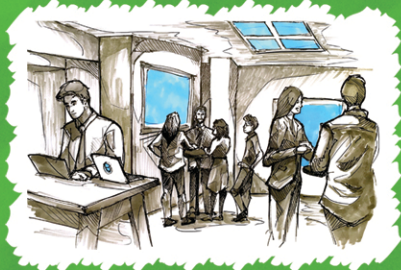
Participants assemble in groups