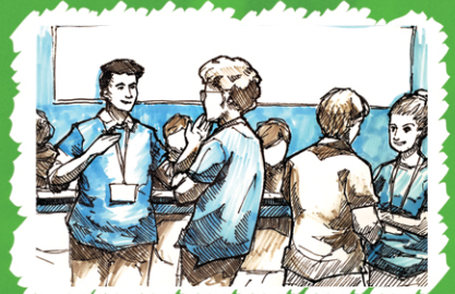
Awarding ceremony and networking