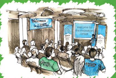
Teams present pitches to a jury of experts