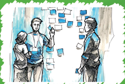
Coaches help teams develop their ideas