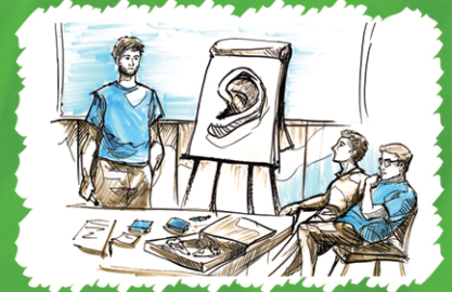
Teams begin taking on their challenges and brainstorming ideas